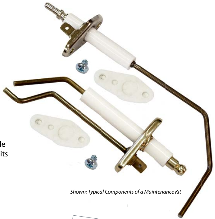
Shown: Typical Components of a Maintenance Kit

For further information visit www.aerco.com .